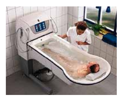
Special bathing equipment