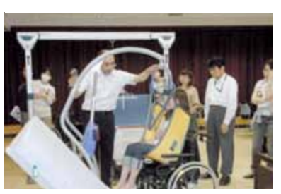
Seminar by equipment specialist